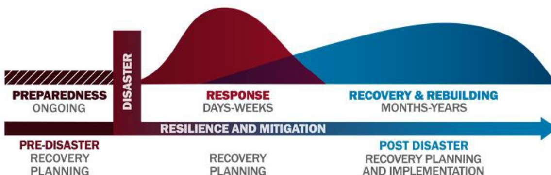
Figure 2: Recovery Continuum

It is imperative to consider and incorporate recovery priorities and outcomes during early post-disaster goal setting. Recovery goals can be both near-term (e.g., restoration of disaster affected publicly owned infrastructure, reopening schools, supporting temporary housing solutions, implementing debris removal plans) and long-term (e.g., housing implementation plans, economic recovery). Information obtained during response such as geospatial damage assessments, among other data sets, can serve as the foundation for developing a Recovery Needs Assessment and disaster recovery plans. As community lifelines are stabilized, the decision to transition from response to recovery and rebuilding sets the stage for durable and resilient outcomes.