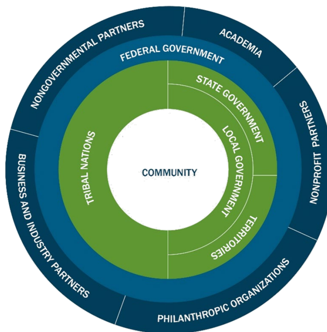
Figure 3: Community-Driven Recovery

Best practices to consider implementing pre-disaster include: